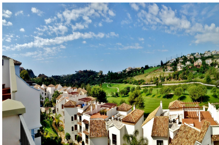
90 sq. mtrs. of rooftop solarium